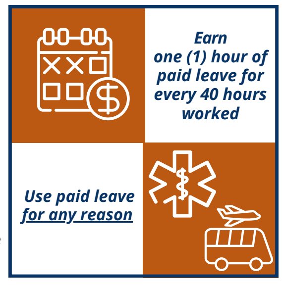
Effective Date 12/31/2023

Visit www.cookcountyil.gov/PaidLeave for more information.